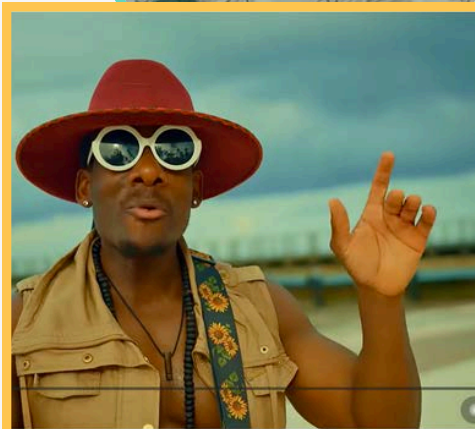
Music Video 4k)